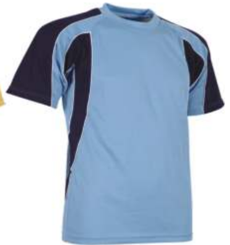
SKY / NAVY / WHITE