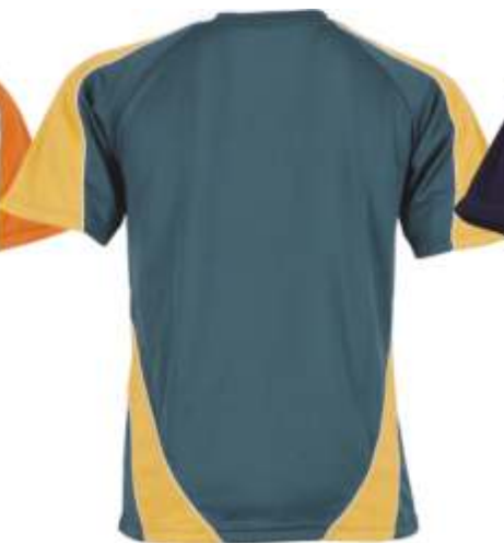
DARK BOTTLE / GOLD / WHITE