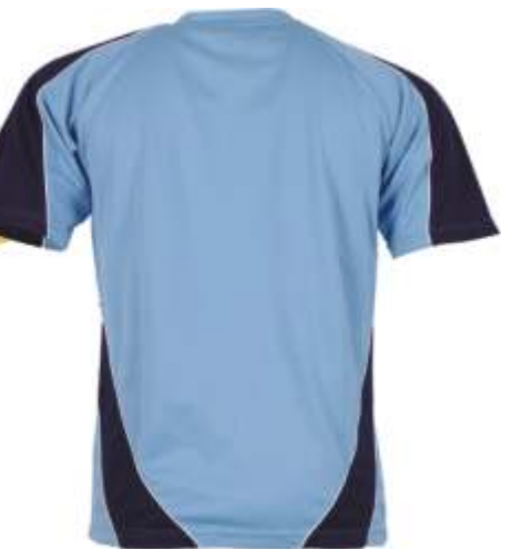
SKY / NAVY / WHITE