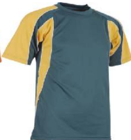
DARK BOTTLE / GOLD / WHITE